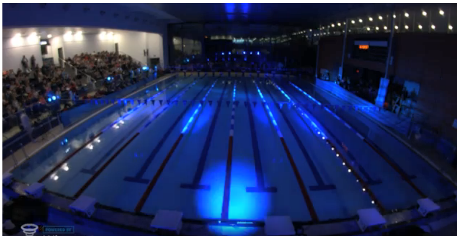
The Venue – transformed!

There has been feedback from a Sky employee, and an ex-BBC employee that the quality of the feed put out on YouTube is “broadcast” quality, and they were VERY impressed with the coverage provided.