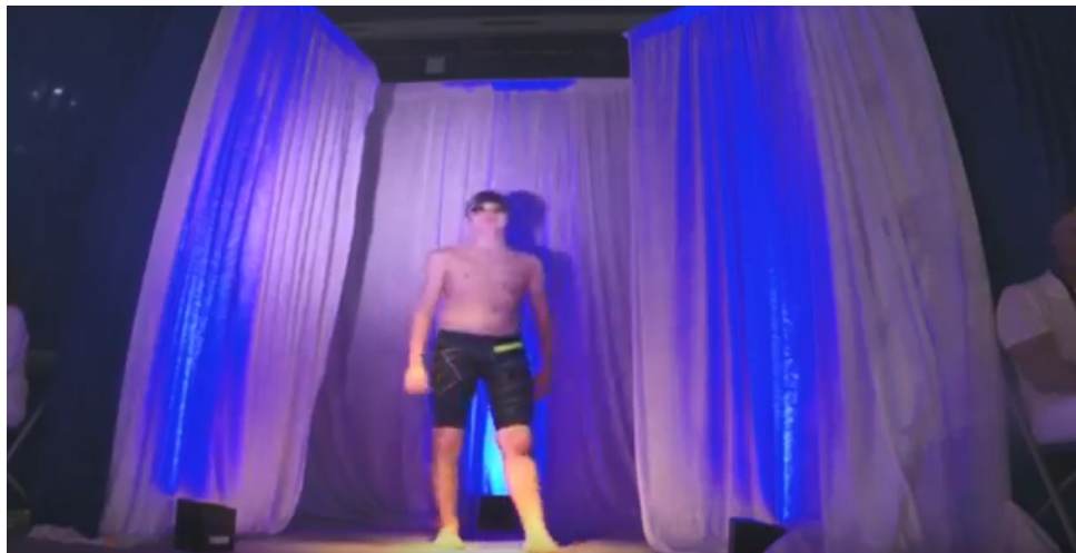
Finalists in the spotlight